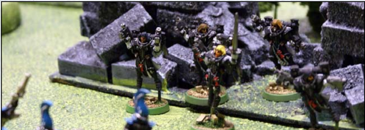
Seraphim of the Order of the Valorous Heart stand defiant on holy ground against a Xenos raiding party.

Both the Attacker and Defender begin rolling for Reserves (including units deployed via Deep Strike, Summoning or other special rules) on Turn 1 instead of Turn 2.