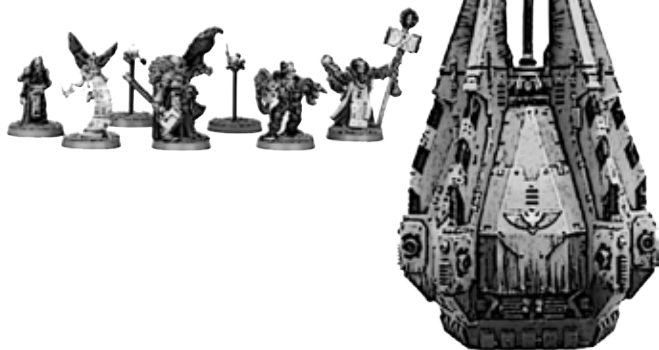
Inquisitor Lord Valis