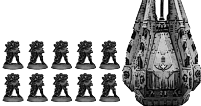
Celestian Squad Priors