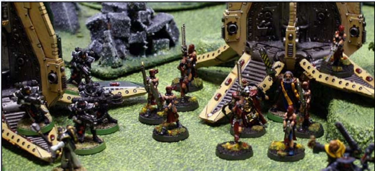
Sisters Repentia pour from the wreckage of a Drop Pod, urged on by a Priest's unyielding litanies.

Blessed: Celestians may always use their unmodified Leadership 9 for any Morale checks or Pinning tests.