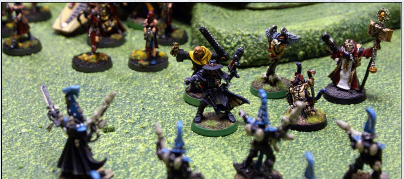
Inquisitor Lord Gorske prepares to lay the smack down on an unsuspecting Autarch.