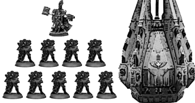
Canoness Agatas, Order of the Ebon Chalice