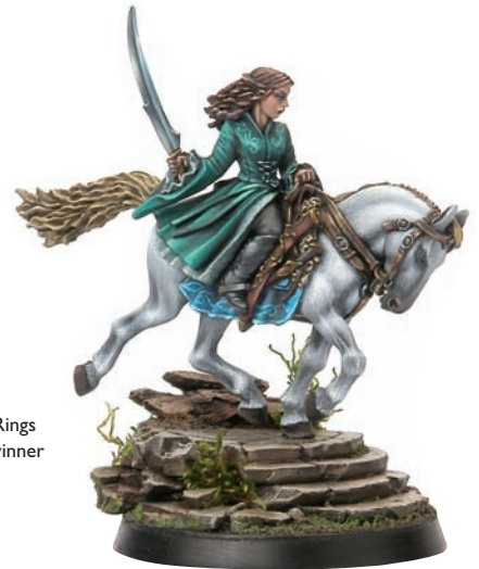
Right: Arwen by Natalya Melnik, 2010 Baltimore The Lord of the Rings Single Miniature Category Gold winner